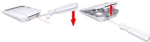
Figure 1: Opening the K32LCD+